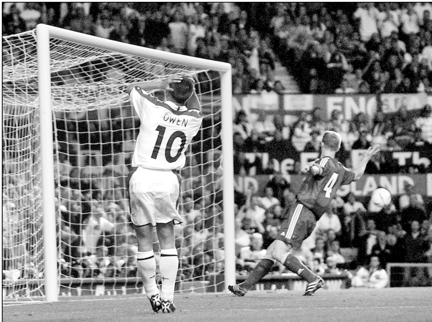
OH NO! England ace Michael Owen holds his head after putting the ball across Liechtenstein's open goal at Old Trafford in Manchester on September 10.