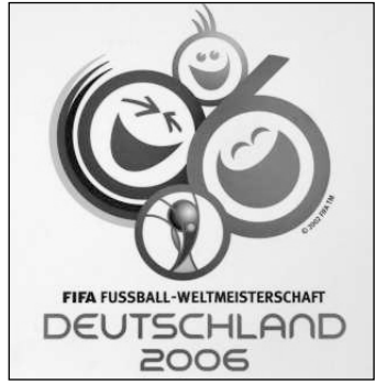
REUTERS, Rio de Janeiro

Bolivia and Paraguay, both thrashed in their opening World Cup qualifiers at the weekend, hit back by scoring four goals each on Wednesday in an astonishing start to the marathon South American tournament.