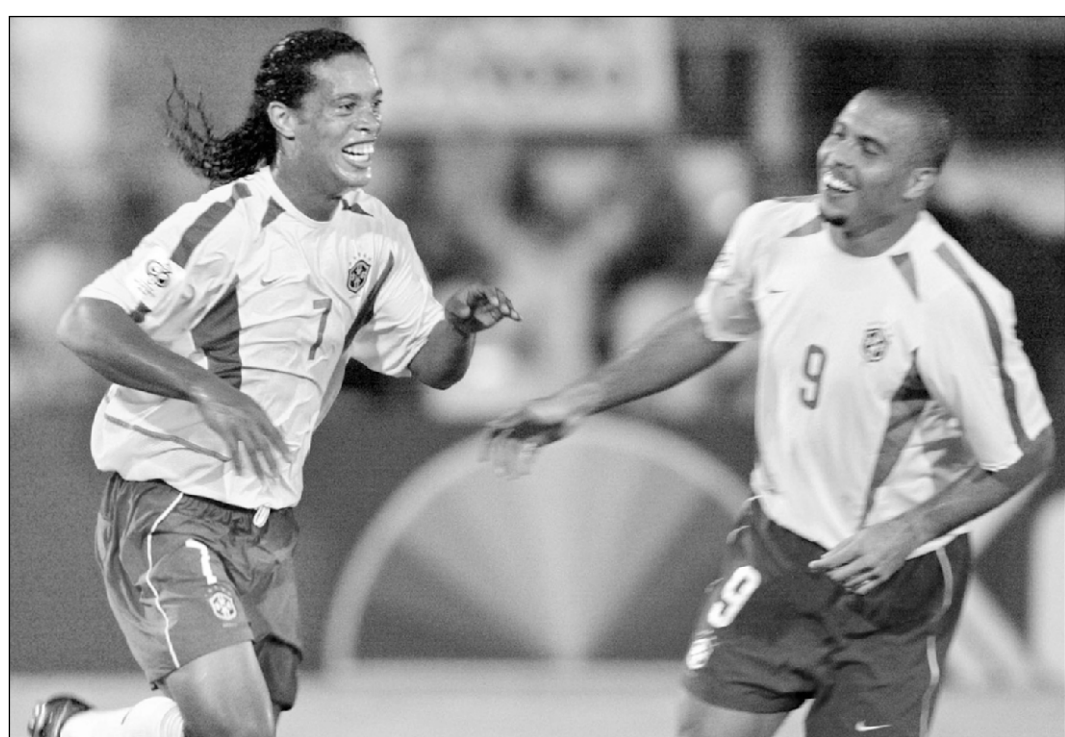
Brazil's Ronaldinho (L) starts celebrating his goal against Ecuador as teammate Ronaldo approaches to congratulate at the Vivaldo Lima stadium in Manaus on September 10.