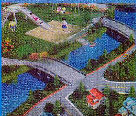
A Perspective view of Modhumoti Model Town. Project Site: 11 km. West of Amin Bazar Bridge, adjacent to Dhaka - Savar Highway.