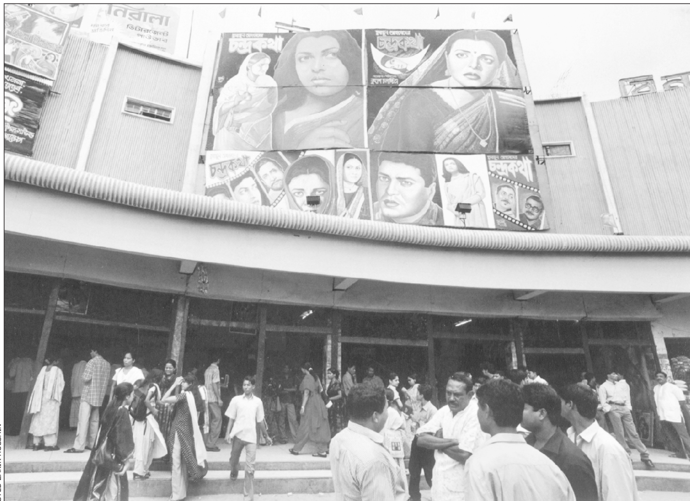
With the release of some decent films recently a wide range of audience is returning to cinema again.