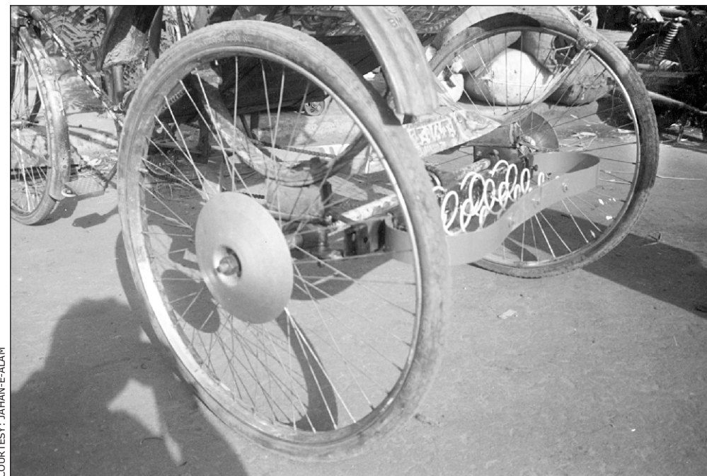
New innovations to keep rickshaws away from hurting.