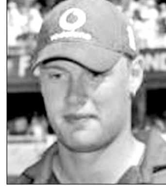
ANDREW FLINTOFF series win in England since 1965 are slim, Trescothick believes that Flintoff, 10 not out, could have a vital role to play.

Marcus Trescothick said all-rounder Andrew Flintoff could take England to an improbable win in the fifth and final Test against South Africa here at The Oval.