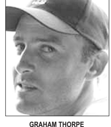
GRAHAM THORPE when I made my debut because I definitely wanted to do well," added Thorpe, appearing in his 78th Test match.

Graham Thorpe said he could not "have written it any better" after scoring a hundred for England against South Africa in his comeback Test match at his Oval home ground here Saturday.