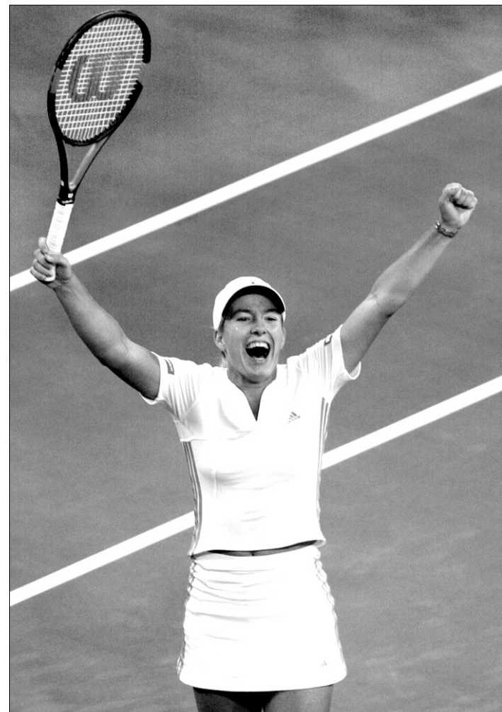
OH MY GOD! Belgian Justine Henin-Hardenne is relieved after beating compatriot Kim Clijsters to win her first US Open singles title on Saturday.