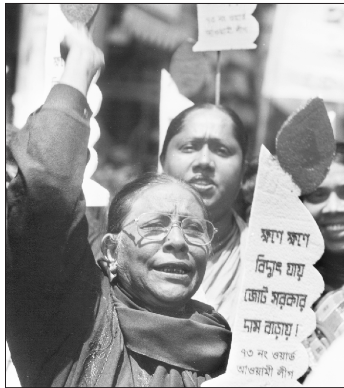
Sutrapur and Kotowali thana Awami League took out a procession in the city yesterday protesting power tariff hike.