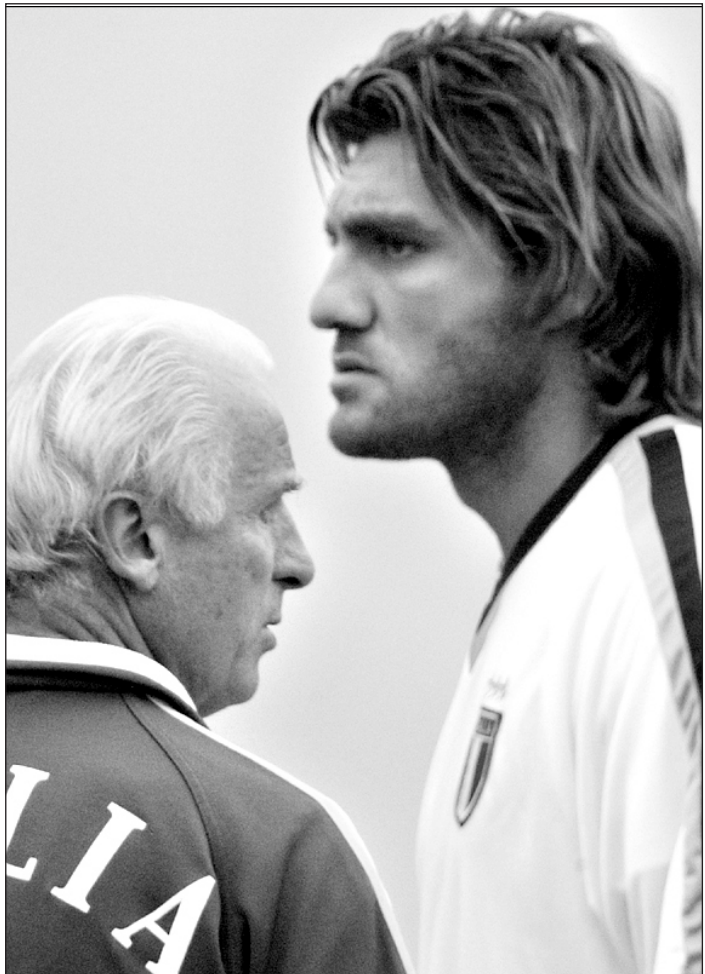
Italy striker Christian Vieri (R) comes takes to the field with coach Giovanni Trapattoni to take part in training at Appiano Gentile on September 5.

European football's governing body UEFA has threatened to throw both sides out of European football if there is a repeat of the scenes which followed the England-Turkey game at Sunderland in April.