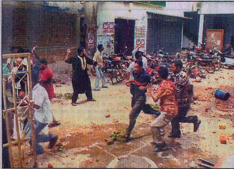
Activists of the Jubo Dal, the youth front of the ruling BNP, throw stones at pro-Awami League lawyers (not seen) in attacks that injured at least 50 lawyers at the Dhaka Bar Association office yesterday. (Right) A policeman escorts a lawyer to hospital after he was wounded in police clubbing.