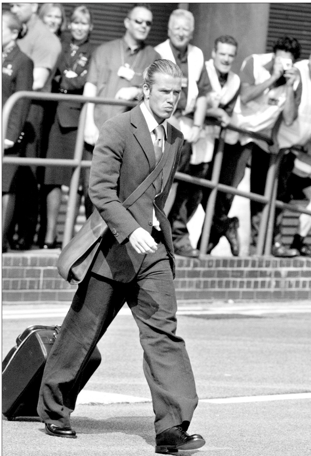
DRESSED FOR THE TRAVEL! England captain David Beckham walks towards the British Airways flight that would take his team to Skopje, Macedonia on September 4.

"Otherwise, though, it will be the same and I'll still be concentrating on trying to win just like the players."