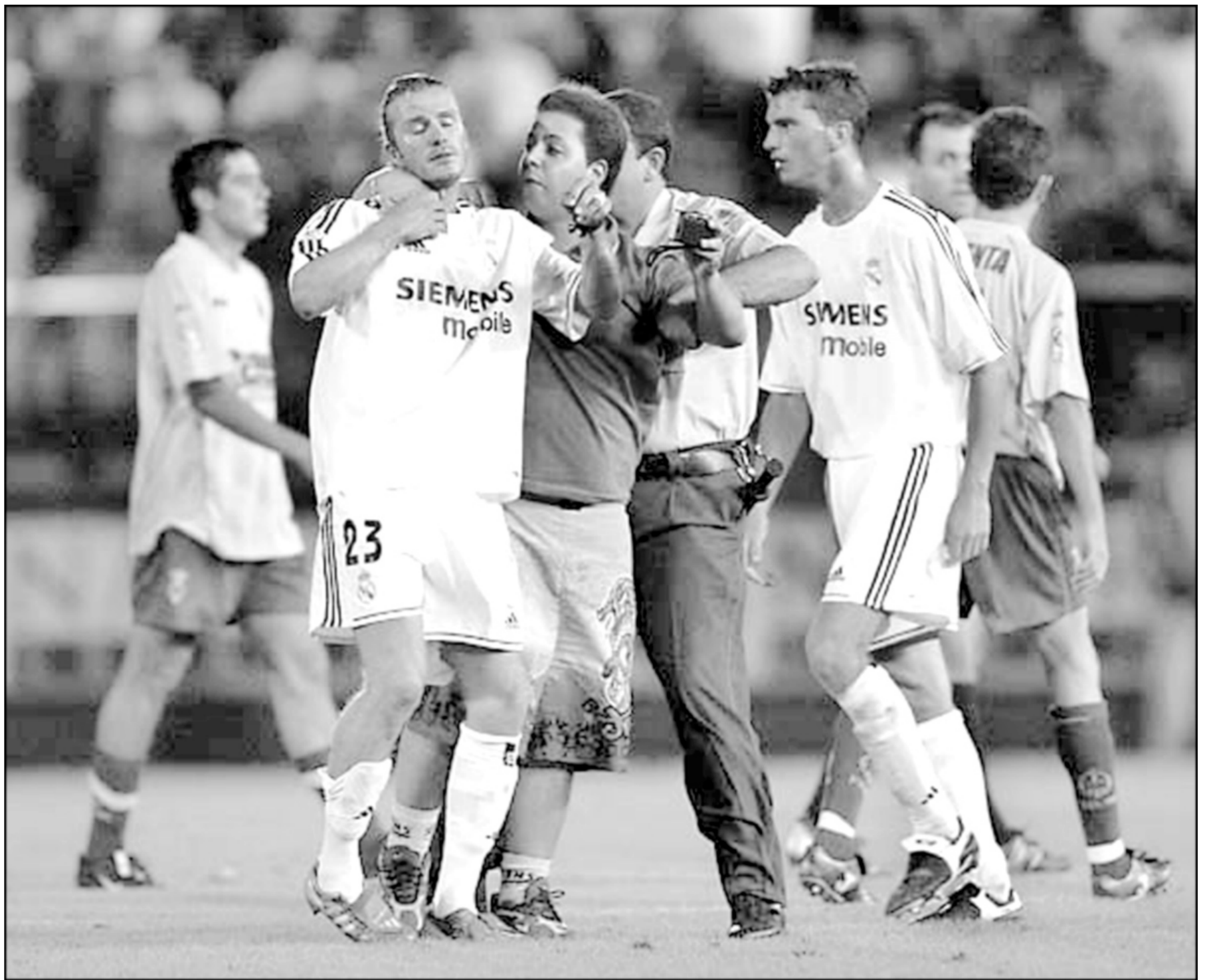
WWF? (1) Barcelona's Luis Enrique (L) and Sevilla's Javi Navarro in no mood to play at the Camp Nou stadium in Barcelona. (R) Real Madrid's David Beckham caught up in a security scare as a crazy fan gets hold of him during the match against Villarreal.