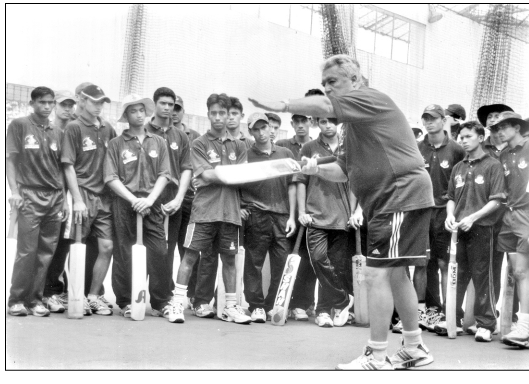
ICC's high performance manager Bob Woolmer imparting some batting tips to the under-19 players who took part in his five-day training camp at BKSP in Savar recently.