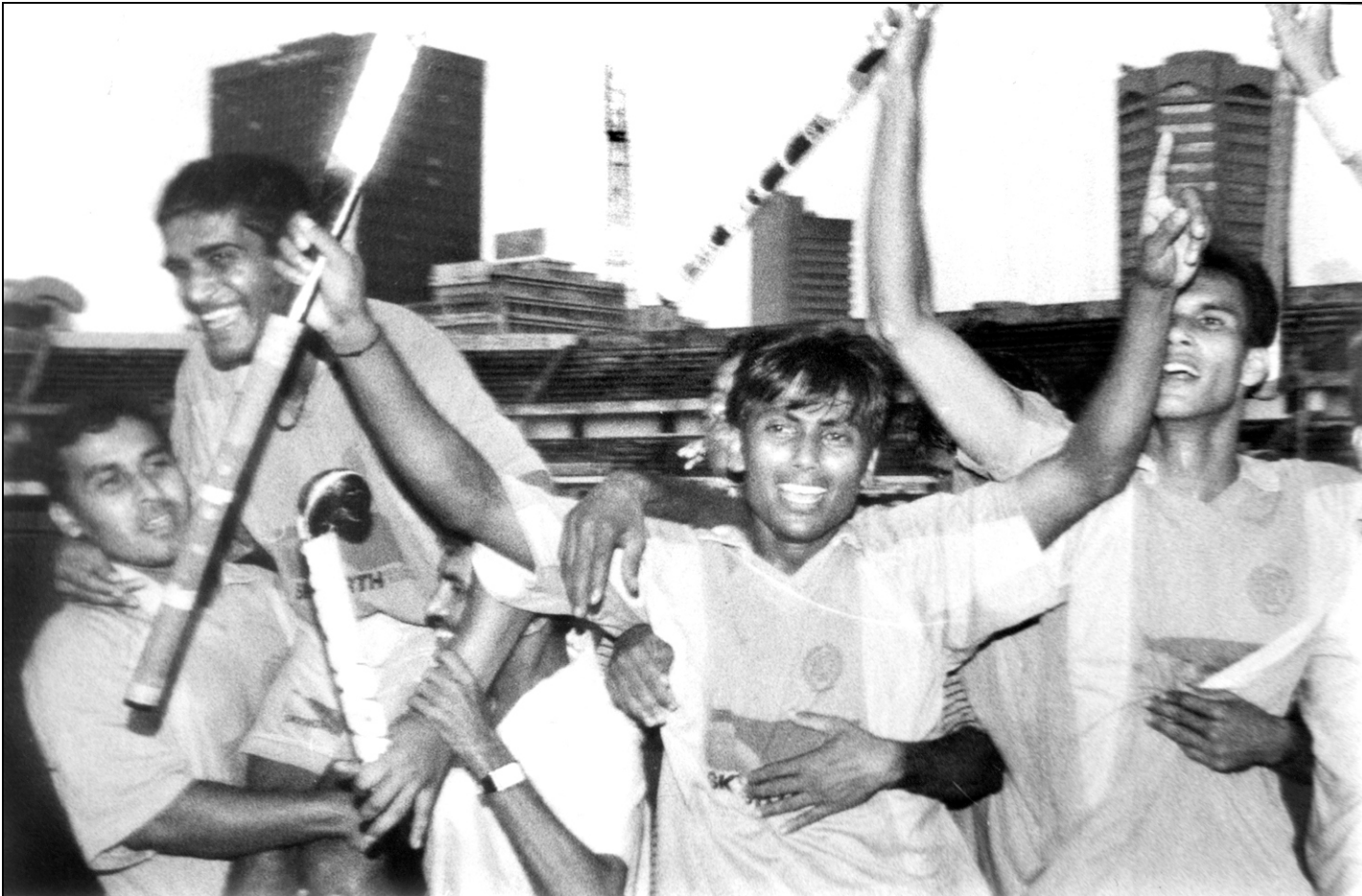
ON CLOUD NINE: Abahani players party after defeating Mohammedan in the last match of the Green Delta Premier Division Hockey League to lift the title at the Maulana Bhasani National Stadium yesterday.