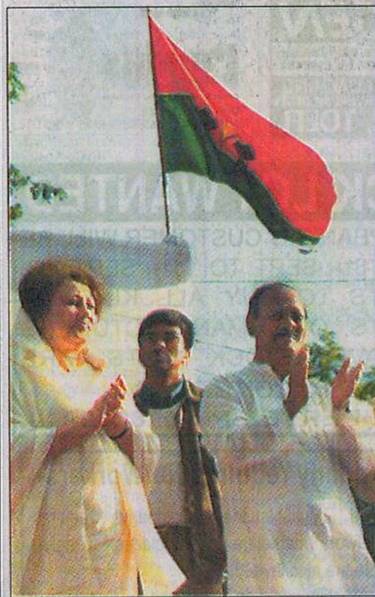
BNP Chairperson Khaleda Zia and Secretary General Abdul Mannan Bhuiyan clap at the inauguration of a rally celebrating the party's 25th founding anniversary, left, and Khaleda, right, leads a procession at Paltan yesterday.