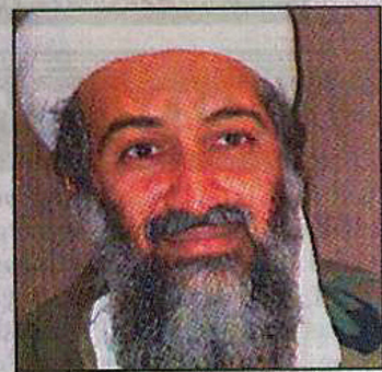
Osama bin Laden

Pakistan, a key ally in the US-led "war against terrorism" has arrested some 500 al-Qaida and Taliban fugitives in the 22-month old cam-