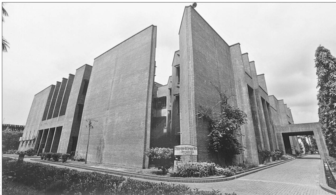
National Library at Agargaon failed to publish the national bibliography for nine years now.

As a result, the library fails to keep references, publish the bibliography regularly and provide its readers with adequate facilities.