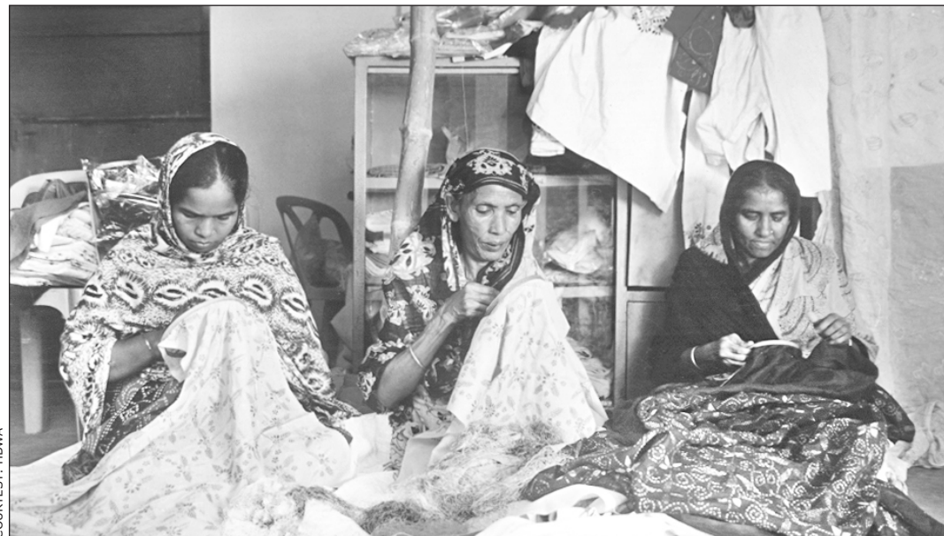
Women making a living working from home demand a national policy.

The work in development will not succeed until and unless social protection measures for women workers in the formal sector are implemented and these strategies are debated and incorporated in the policy making forums. So the need of the hour is a national policy for homeworkers which must specify and incorporate the social security system and inclusion of homebased women workers in the new Labour Code including protection against occupational health hazard, provision of maternity benefits, insurance schemes and policies. Above all national policy should be taken to allow the homebased organisations to form trade union.