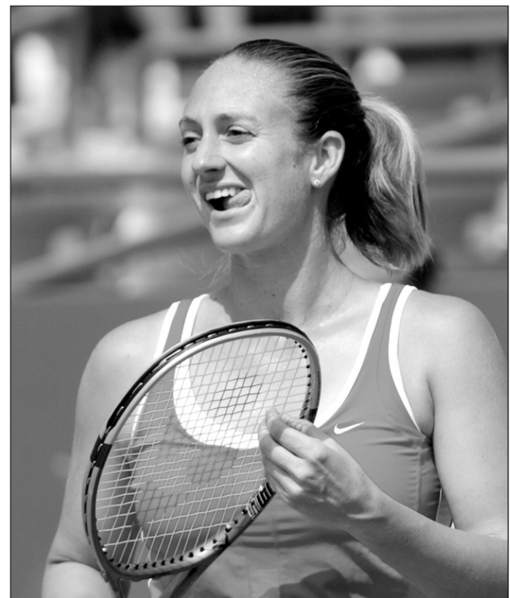
France's Mary Pierce licks her lips after she won a point against Shinobu Asagoe of Japan during their US Open engagement at Flushing Meadows in New York on August 30. Pierce won the match 6-4, 6-1.

of his Grand Slam career. The American world number 74 came from two sets to one down to beat Chilean 15th seed Fernando Gonzalez 7-6, 6-7, 3-6, 7-6, 6-4, a victory which gave 22-year-old Dent a fourth-round contest with the winner of the Agassi-Kafelnikov match.