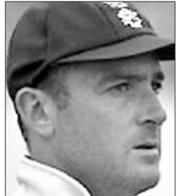
GRAHAM THORPE of injury concerns. "We've chosen Graham Thorpe as a like-for-like replacement for Nasser Hussain," explained chairman of selectors David Graveney.

"Graham is a proven performer at Test level and I'm sure that he will relish the challenge." Bowler Martin Bicknell was included in the squad, although he must undergo a fitness test on a hamstring problem. He was bothered by long-standing hamstring trouble during his Test return last week. England's pace attack has struggled throughout the series, with Andrew Caddick unavailable because of a back problem while Matthew Hoggard is still not fit following knee surgery. Steve Harmison, overlooked from the Headingley starting line-up, is almost certain to regain his place in the starting line-up but the selectors decided against the return of Somerset seamer Richard Johnson, who has been plagued by knee trouble ever since the end of the one-day triangular tournament mid-way through the summer. South Africa, ranked second in the world, won the fourth Test at Headingley to take control of a series they have dominated from the outset. SQUAD Michael Vaughan (captain), Gareth Batty, Kabir Ali, James Anderson, Martin Bicknell, Graham Thorpe, Mark Butcher, Andrew Flintoff, Ashley Giles, Stephen Harmison, Ed Smith, Alec Stewart, Marcus Trescothick.