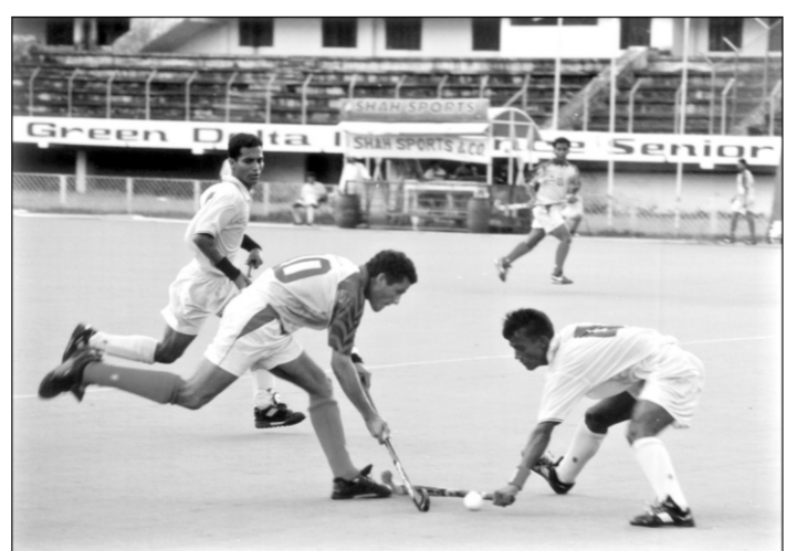
Action on yesterday's Green Delta Premier Division Hockey League Super Five clash between Usha and Sonali Bank at the Maulana Bhasani National Stadium.