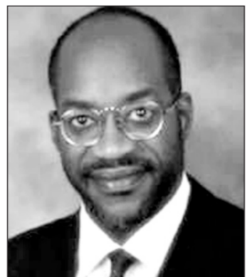
EDWIN MOSES fantastic as I am an old man. "In terms of going to Athens, if things happen they happen. But SEE PAGE 14 COL 8

Two-time Olympic champion Edwin Moses confirmed on Sunday he is making a comeback to the 400 metres hurdles at the age of 48 with an initial aim of qualifying to run in the trials for the US team for next year's Olympics in Athens. The former world record holder held a press conference to officially announce his decision on the day of his 48th birthday and the anniversary of his last world record of 47.02sec in 1983. The American said his first aim was to achieve a time more than three seconds slower - 50.55sec - which would qualify him to run in next year's US Olympic trials. "If it is possible for me to appear at the Olympic trials that would be