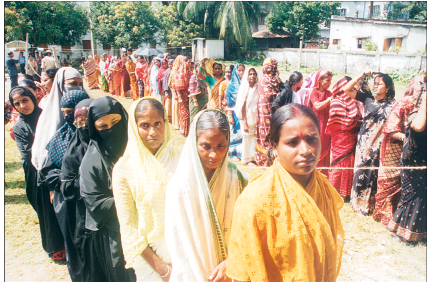
Voters line up at the Savar High School polling centre to cast votes in elections to Savar Pourashabha (municipality) yesterday. The polls were held after a space of nine years.

The AL candidate himself became the polling agent at the centre with permission from the centre's presiding