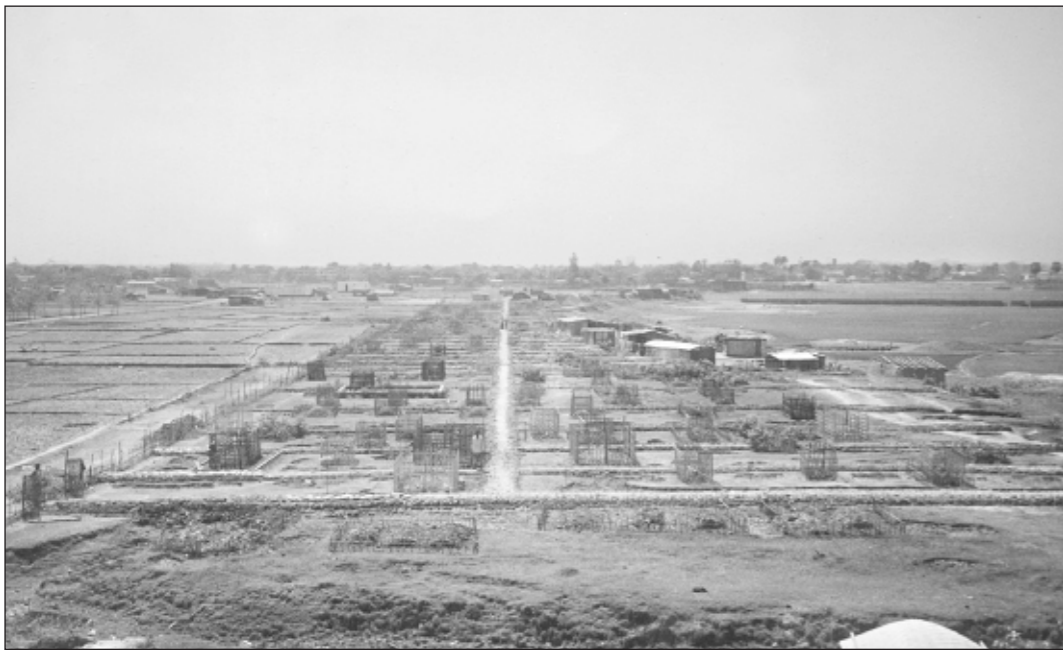
Rajuk had designated sections of this graveyard in Uttara as residential and commercial plots.

Not only residents of Uttara but those of Nikunja, Tongi and Baridhara as well use the graveyard that has now more than 250 graves.