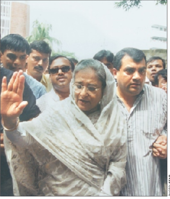
Sheikh Hasina at court yesterday in frigate purchase case..

Polyarny when floating hulls supporting it broke apart. It tipped over and sank three miles northwest of Kildin Island. There were only 10 crew on board when the accident happened at 8 p.m. EDT. The incident bore uncanny echoes of the Kursk disaster in which a nuclear submarine sank also in the Barents sea, three years ago this month, killing all its 118 crew and enveloping the then newly elected President Vladimir Putin in a political row. Another similarity is that Putin is on holiday as he was when the Kursk went down -- this time in Sardinia with Italian Prime Minister Silvio Berlusconi. The Kremlin said Putin had been informed of the incident by Defense Minister Ivanov.