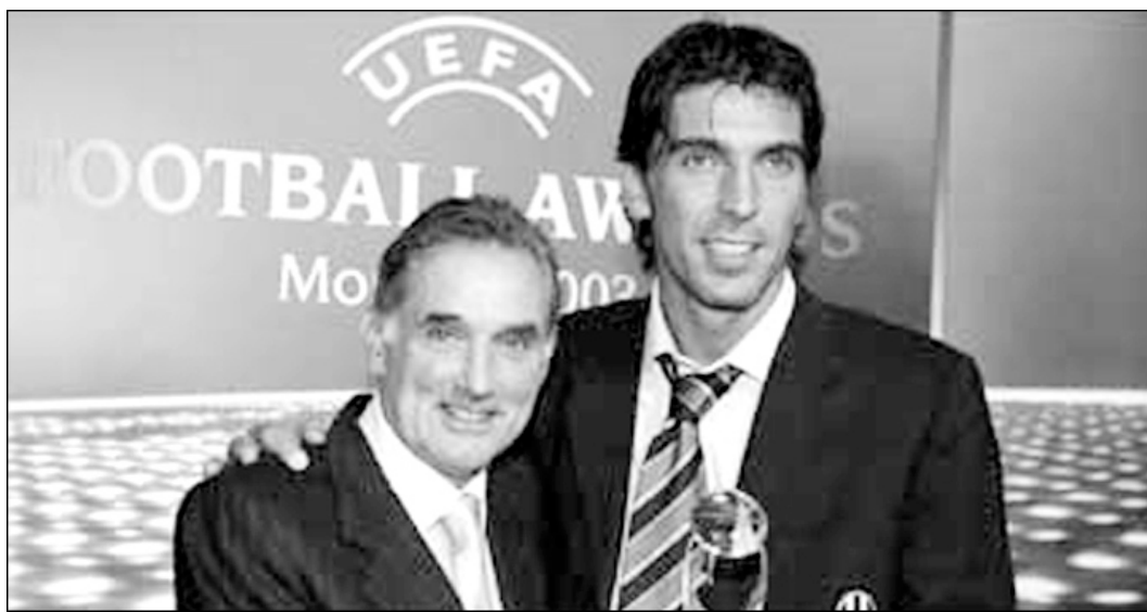
Juventus goalkeeper Gianluigi Buffon (R) poses with the legendary George Best after receiving the Most Valuable Player award at the UEFA European Football Awards ceremony in Monaco on August 28.

"The FA have today charged Manchester United manager Sir Alex Ferguson with misconduct for breaches of FA Rule E1 and E2.