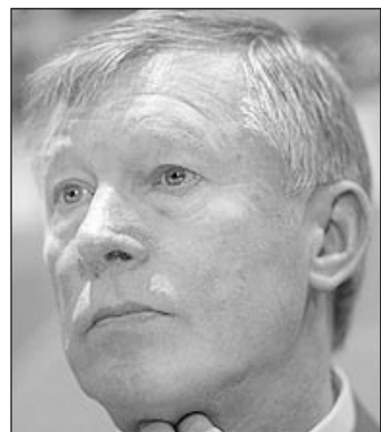
SIR ALEX FERGUSON

He appeared especially enraged when no action was taken against Andy O'Brien for his challenge on Ryan Giggs with some reports suggesting he reacted by calling the