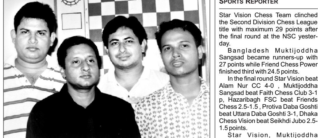
Members of the Star Vision Chess Team pose for photographs yesterday.

Shoaib and Sami have headed Pakistan's new-ball attack since the axing of Wasim Akram and Waqar Younis after the World Cup.