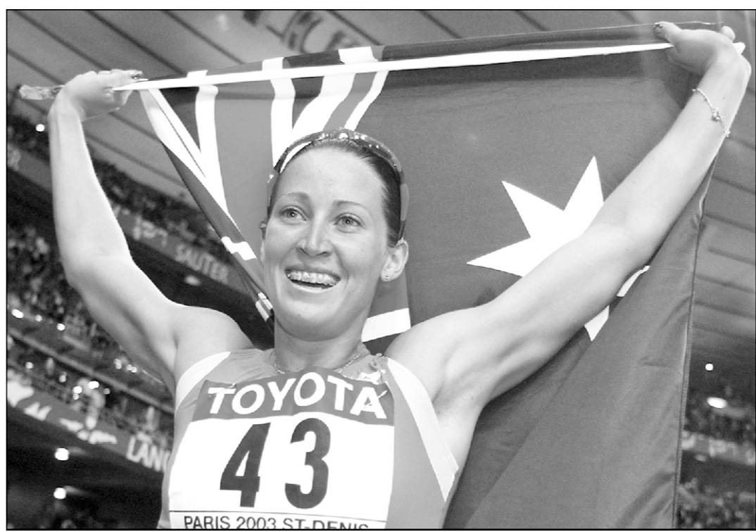
Australian Jana Pittman holds her national flag after winning the women's 400m hurdles gold at the 9th Athletics World Championships on Thursday.