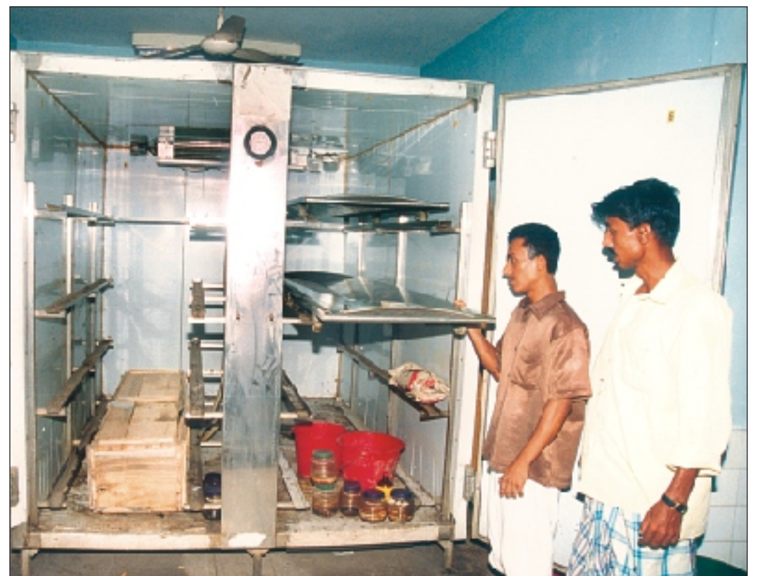
Workers at the mortuary of Dhaka Medical College Hospital show the lone refrigerator that has remained out of order for the last 11 months, affecting autopsies.