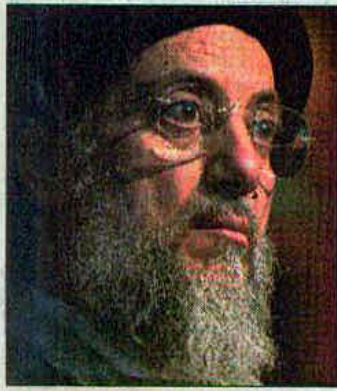
Mohammed Baqer al-Hakim