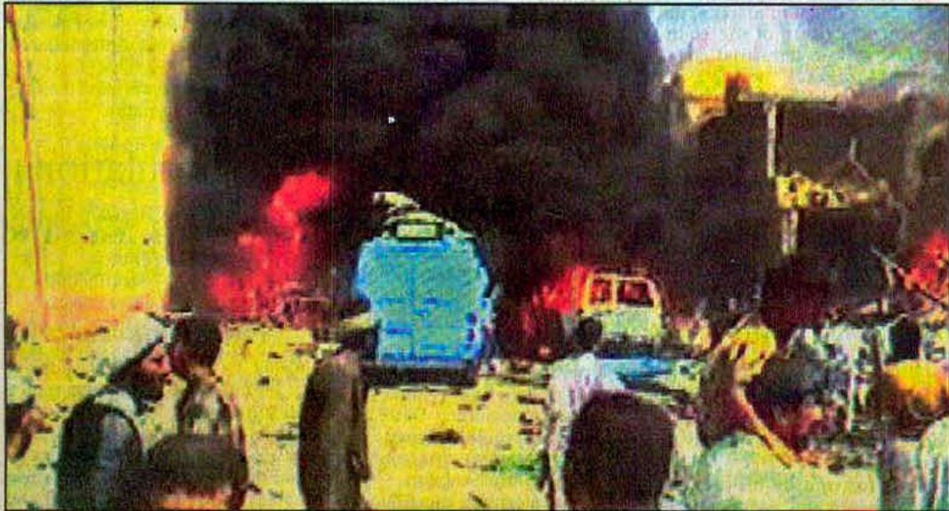
A TV grab from Lebanon-based Al-Majar channel shows burning vehicles after an explosion in the Iraqi city of Najaf yesterday.