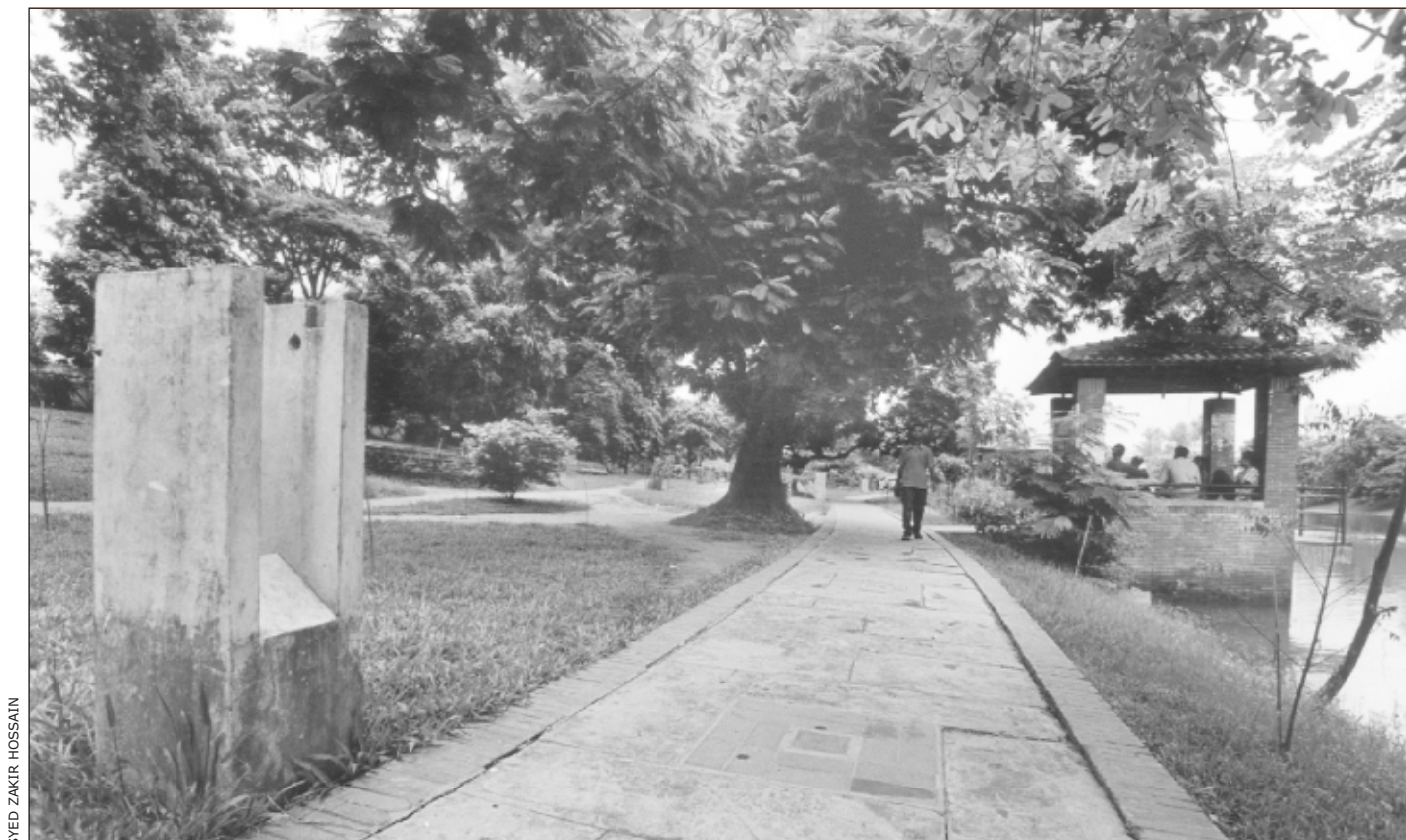
All is set for installing lights along the walkways of Dhanmondi lake. But when will they be lit?

People now speculate how many days they have to suffer from bureaucratic tangles