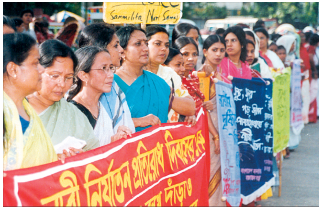
Sammilita Nari Samaj, a women's group, holds a protest rally in front of the National Museum yesterday marking the Day for Resistance to Repression on Women.