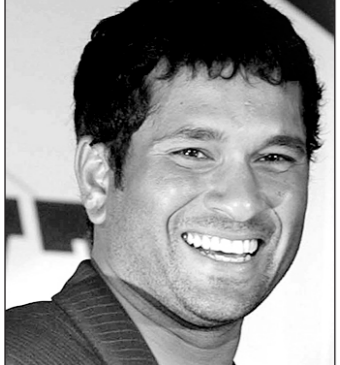
Sachin Tendulkar (India's star batsman) "There's no race between Steve and me, nor is there any rivalry." On Steve Waugh.