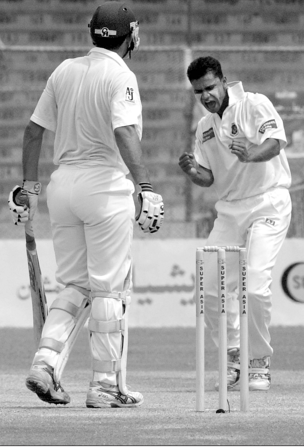
JOY UNLIMITED: Bangladesh fast bowler Mashrafe-bin-Mortuza celebrates after trapping Misbahul Haq lbw during the third day's play in Karachi yesterday.