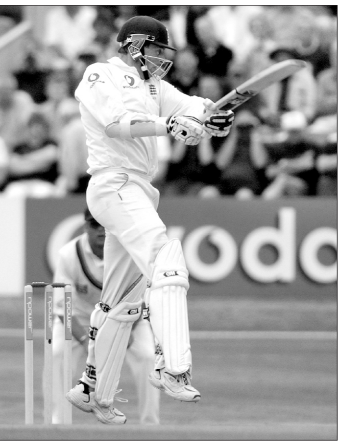
England opener Marcus Trescothick square cuts on to his way to a half-century at Headingley yesterday.