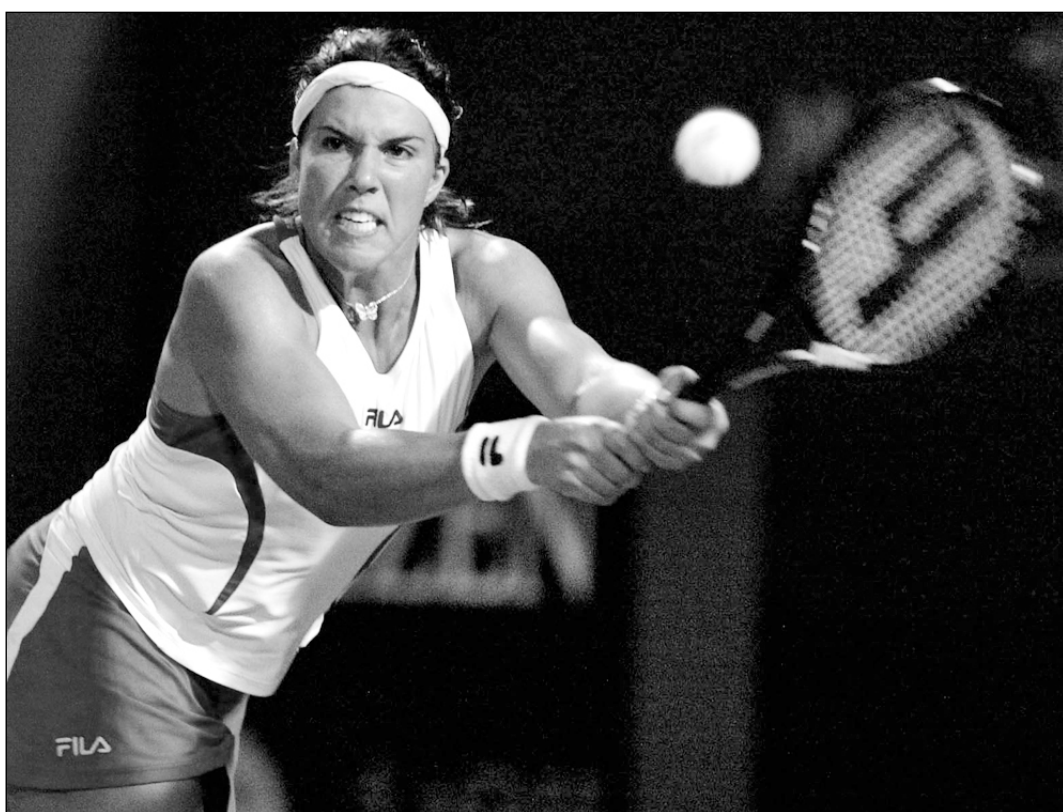
Jennifer Capriati hits returns to Elena Bovina of Russia during their match at the Pilot Pen Tennis tournament on August 20 at the Connecticut Tennis Centre in New Haven.