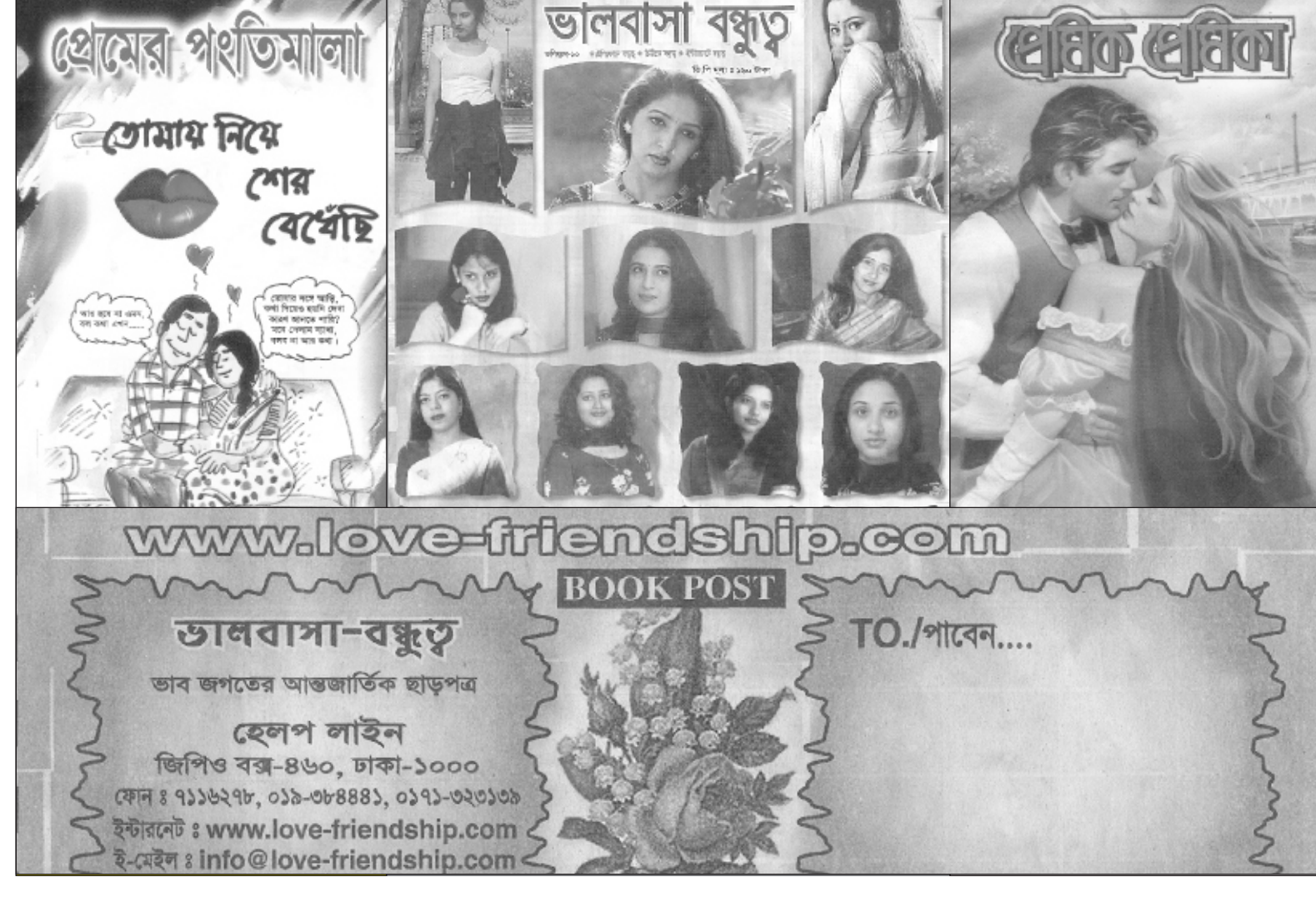
Typical matter supplied by a commercial company which offers "love and friendship" to young hope fulls in love

How is he to get all the digits then? Simply by sending the Help Line Publication Tk 200 more with the filled-in membership form.