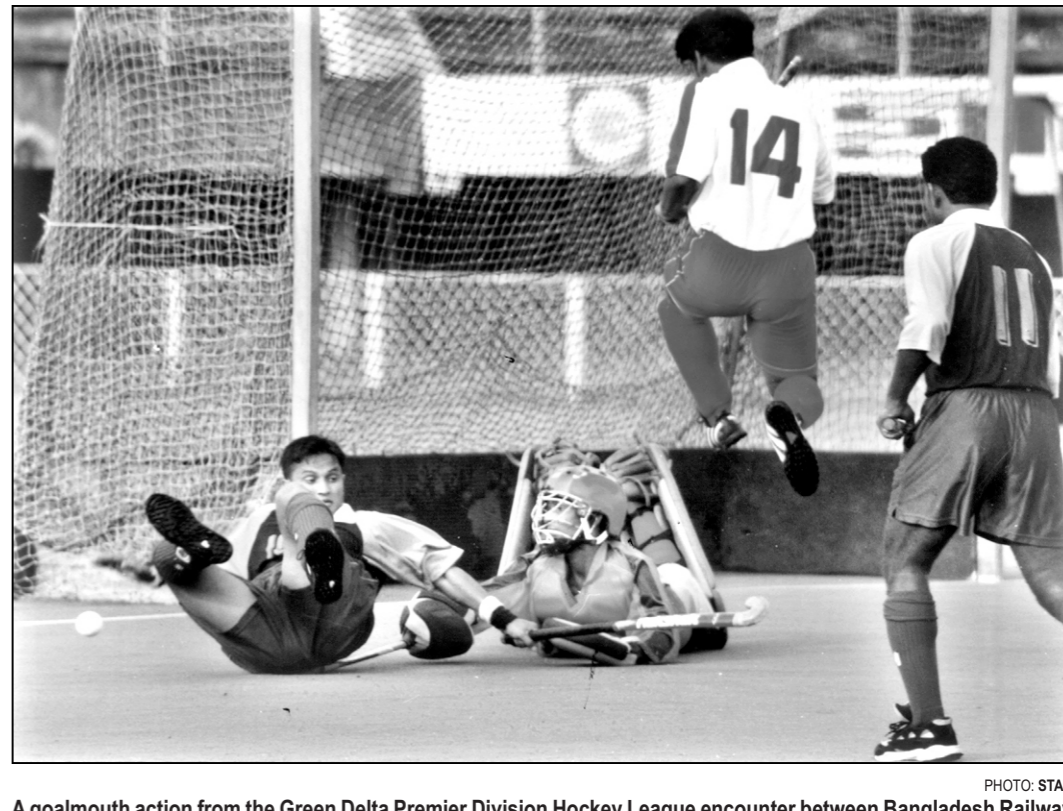
A goalmouth action from the Green Delta Premier Division Hockey League encounter between Bangladesh Railway and Wari Club at the Maulana Bhasani National Stadium yesterday.