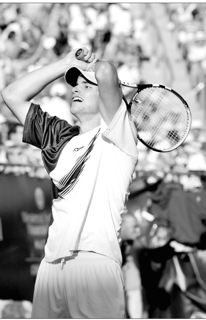
TOO GOOD TO BE TRUE: American Andy Roddick reacts after defeating compatriot Mardy Fish at the Cincinnati Masters Series final on Sunday.

backhand on those two occasions. He then seemed to steal the match from his childhood friend when he executed a winning forehand crosscourt passing shot to break serve and go up 3-2 in the final set tiebreaker.