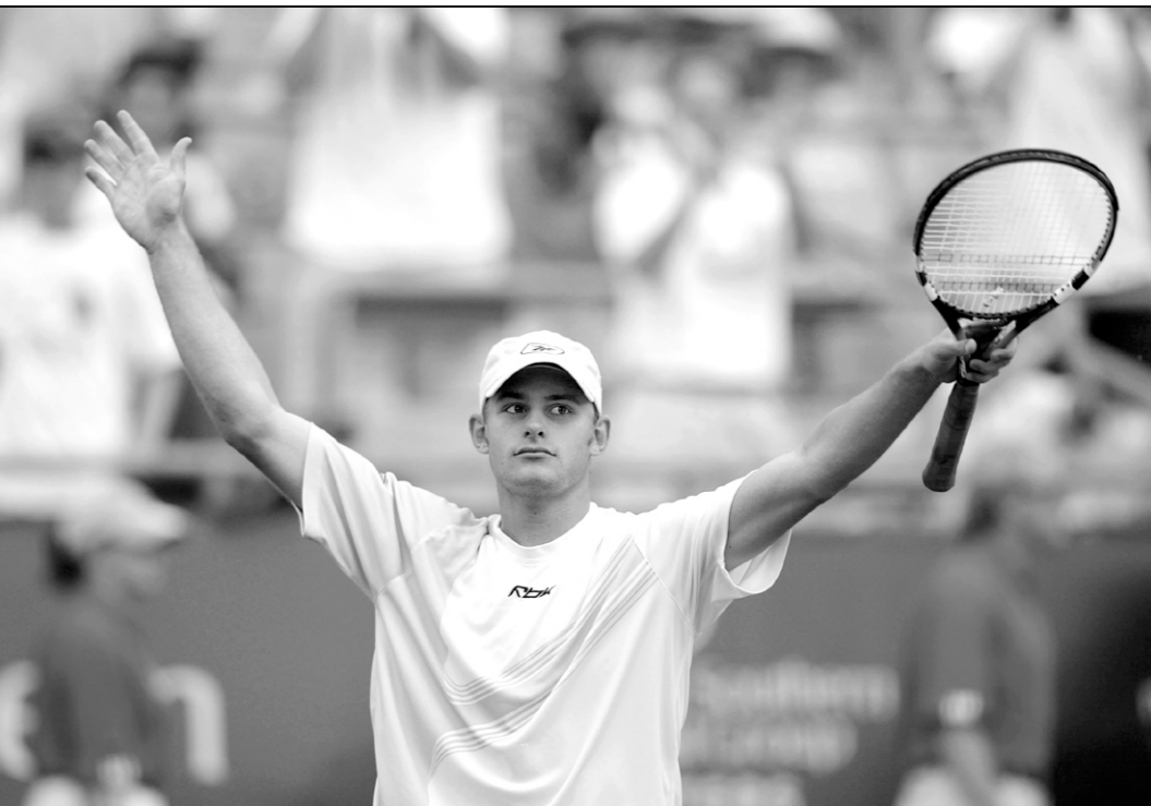
American Andy Roddick celebrates after defeating Max Mirnyi of Belarus at the Cincinnati Tennis Masters Series on Saturday.

Andy Roddick and Marty Fish will play the big final match they dreamed about as boyhood friends on Sunday at the Tennis Masters Series-Cincinnati.