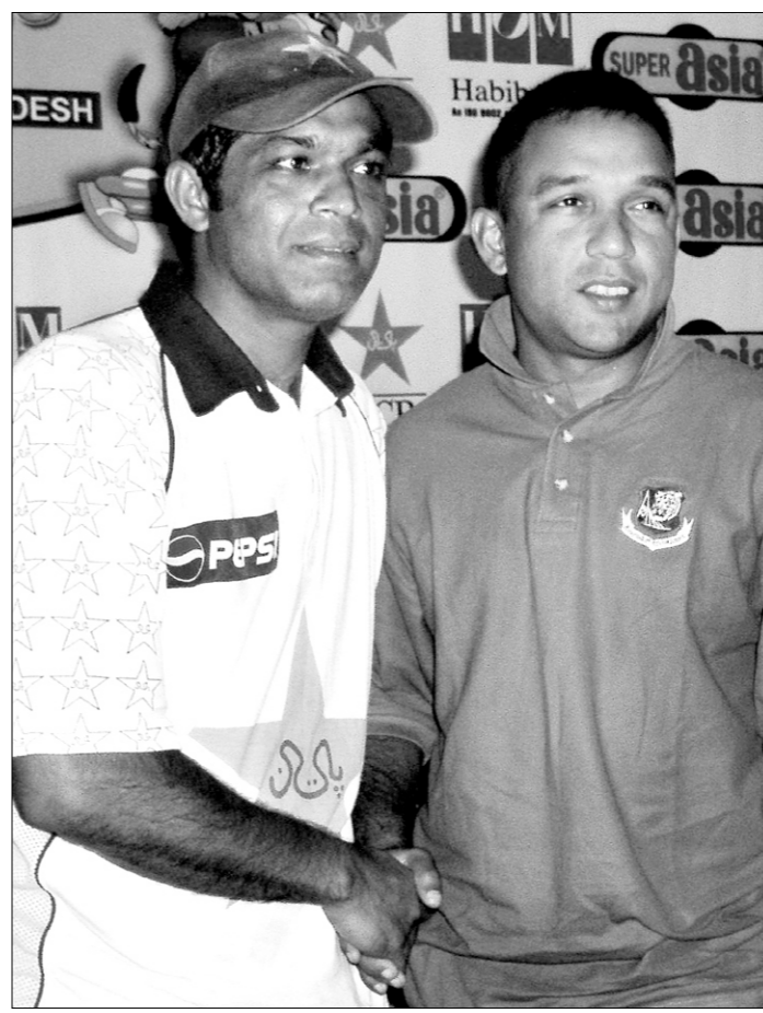
Bangladesh captain Khaled Mahmud (R) and his Pakistan opposite number Rashid Latif shake hands during a press conference in Karachi yesterday.