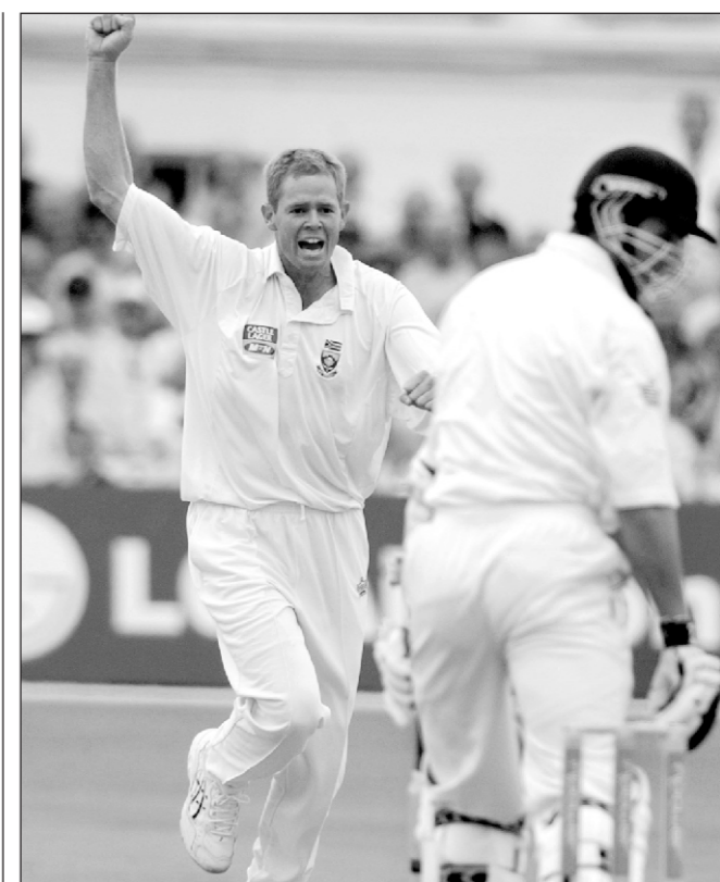
South Africa's Shaun Pollock is elated after taking the wicket of England captain Michael Vaughan on the fourth day of the third Test at Trent Bridge yesterday.