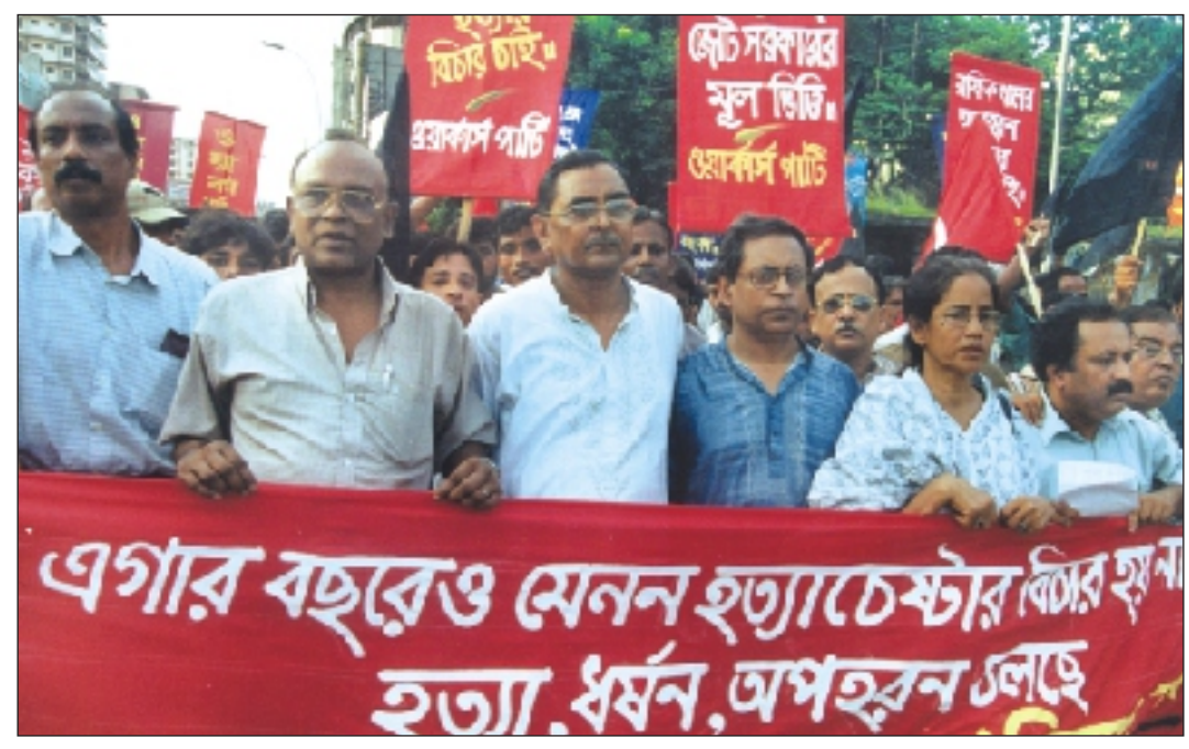
Rashed Khan Menon and other members of his Workers Party of Bangladesh take out a procession in Dhaka yesterday, demanding trial of the perpetrators who shot him 11 years ago and an end to crimes rife in the country.