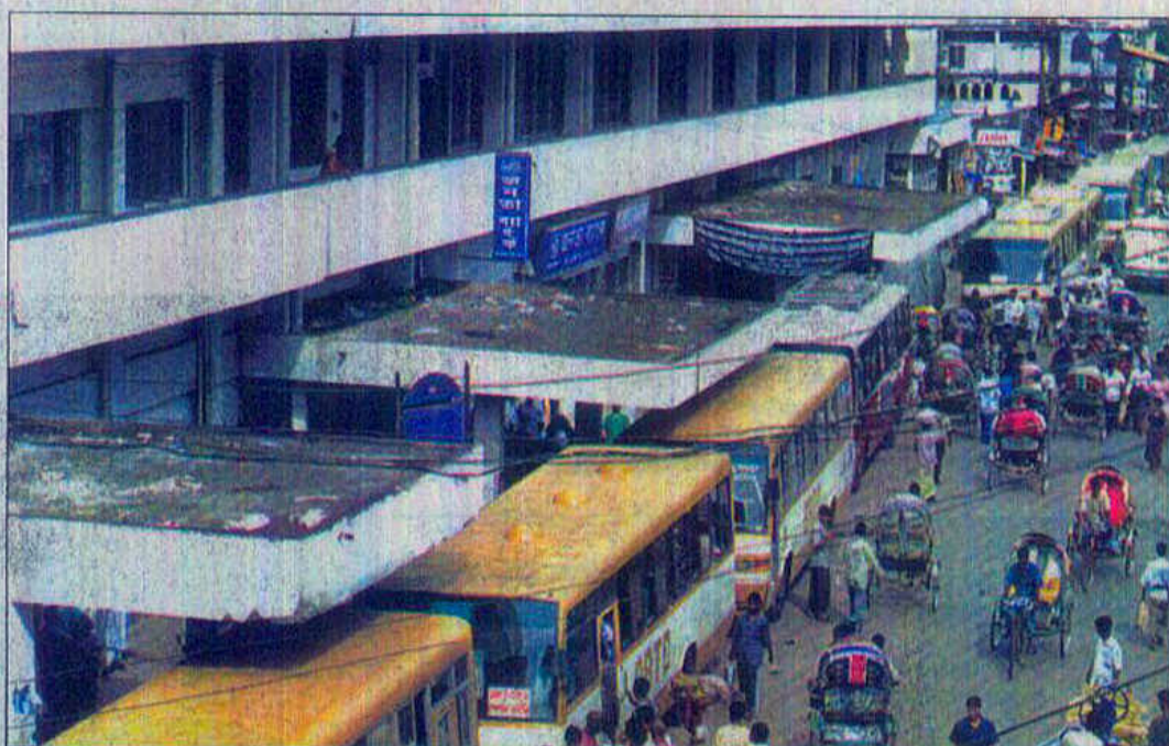
Bangladesh Road Transport Corporation launched a special bus service on the Dhaka-Barisal route from Sadarghat yesterday, offering passengers alternative transport amid an indefinite strike by private launch operators.