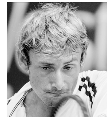
JUAN CARLOS FERRERO