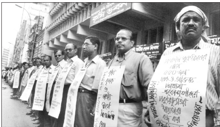
BADC Diploma Engineers' Association forms a human chain in front of the Krishi Bhaban at Motijheel yesterday demanding reinstatement of 550 diploma engineers.