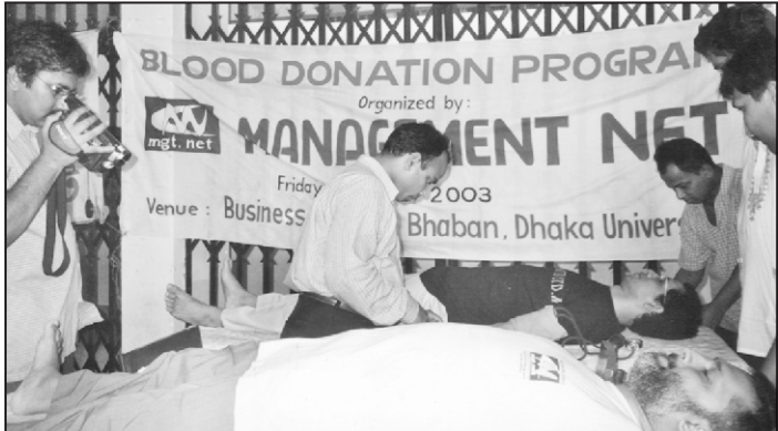
Management Net, an organisation of the ex-students of Department of Management Studies, Dhaka University, organised a voluntary blood donation programme on the university campus on Friday.