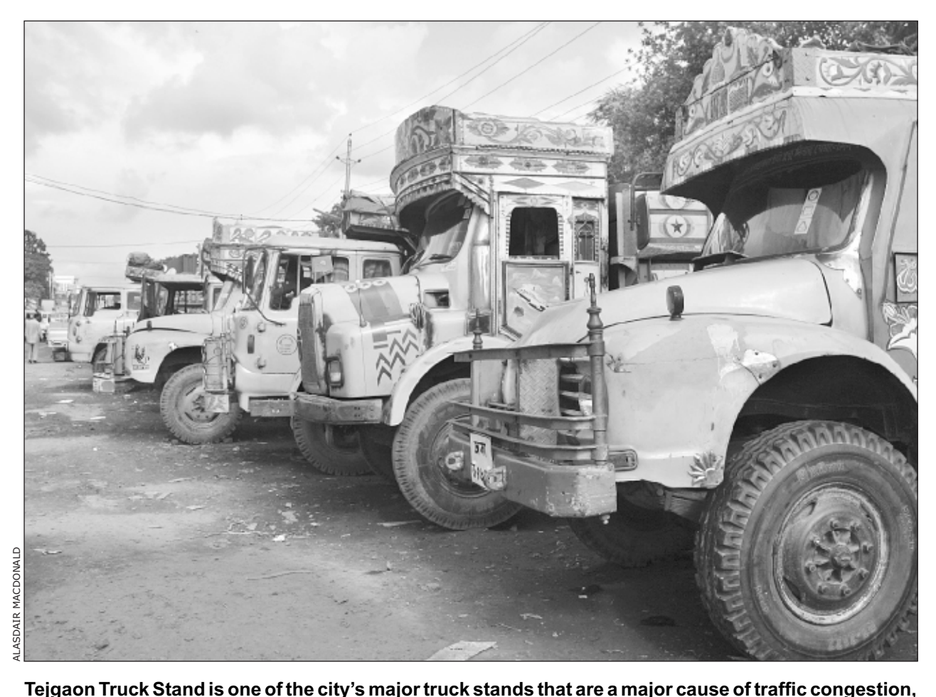
and need to be relocated to a more convenient site.

As major truck stands across the city continue to create needless traffic congestion, Dhaka Metropolitan Police (DMP) last Thursday proposed relocating them to more convenient sites. This proposal came in response to