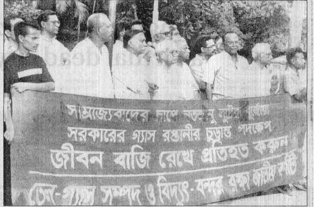
The National Committee for Protection of Oil-Gas Resources stages a demonstration at Muktangan yesterday protesting the move to export gas.