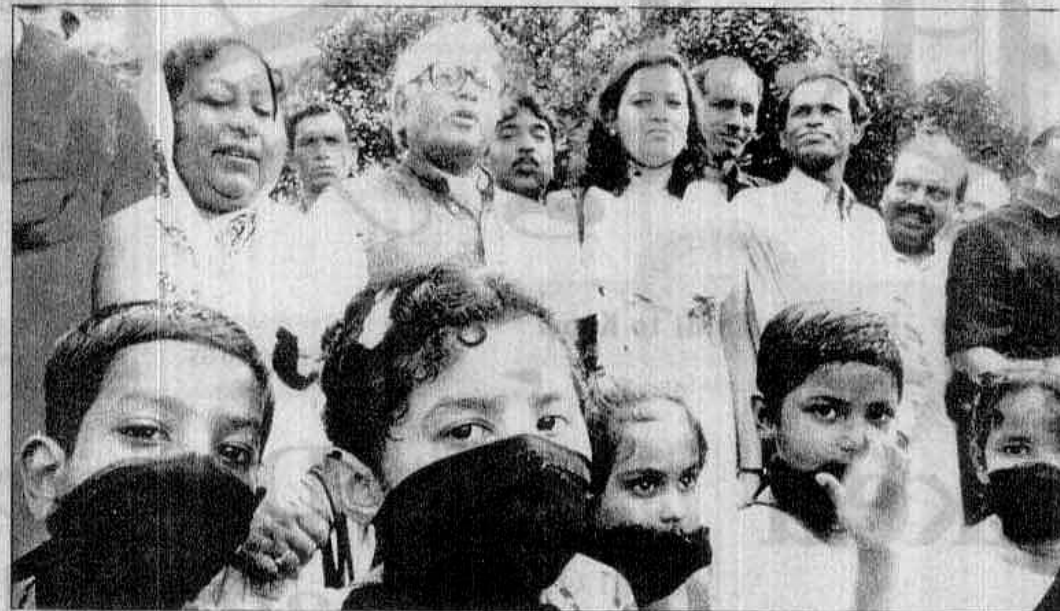
The Chirantan '71 forms a human chain at Muktangan yesterday demanding immediate execution of the verdict in Bangabandhu murder case.

He started his career in DMCH as an assistant surgeon and was elevated to the post of professor in medicine department in 1993.