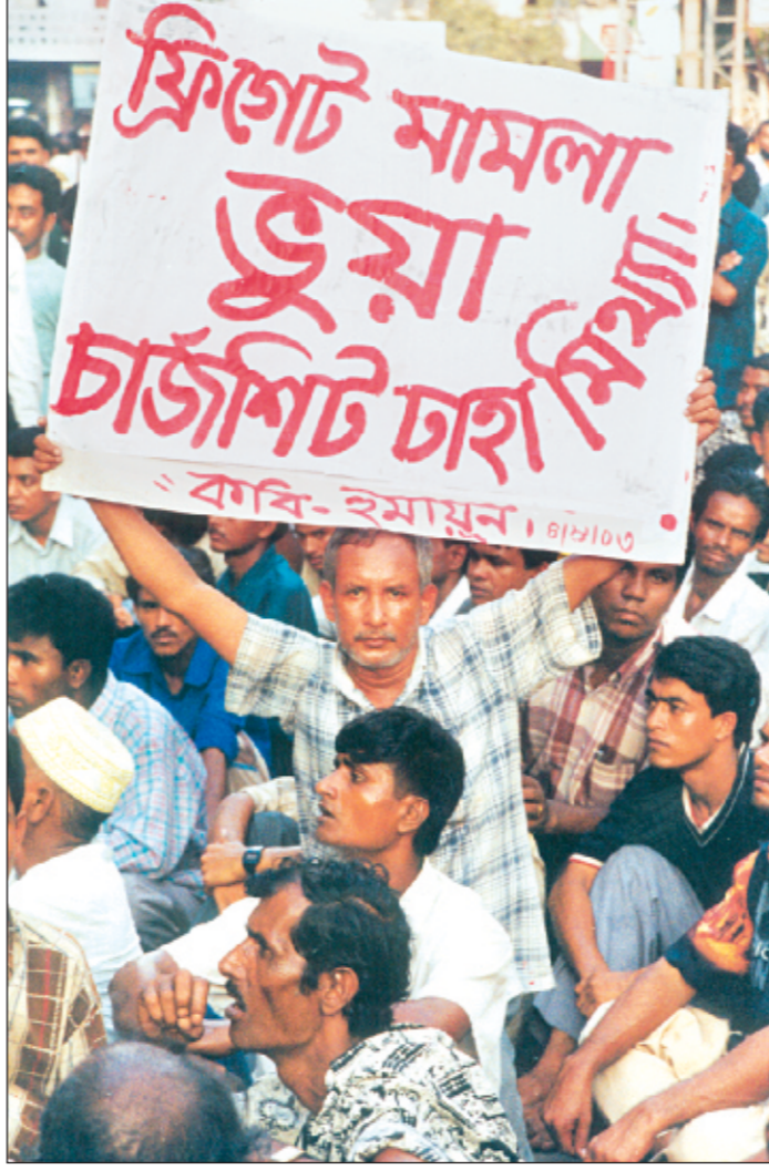
Awami Jubo League stages a demonstration at Bangabandhu Avenue in the city yesterday protesting filing of chargesheet against Leader of the Opposition in Parliament and Awami League President Sheikh Hasina in frigate purchase case.