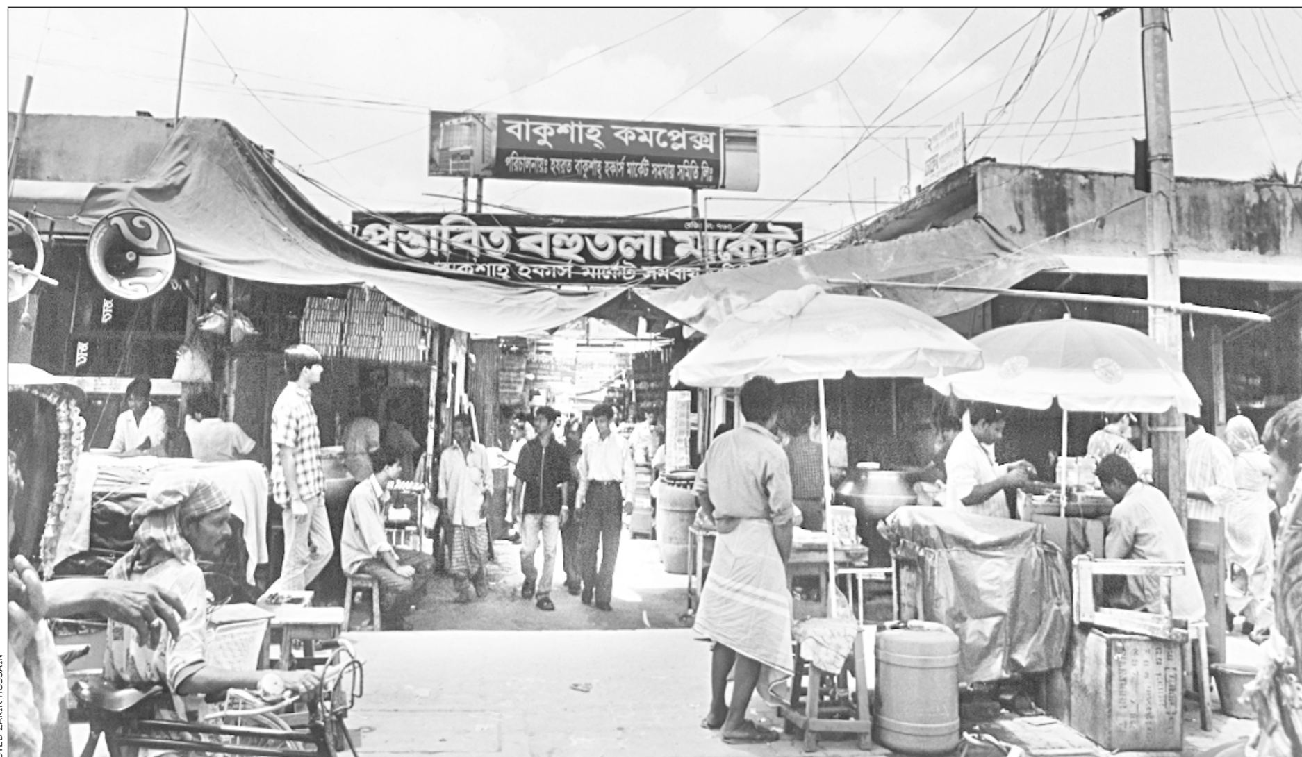
Bakusha Market, though not DCC owned, is just one of the city's major prominent markets illegally occupied and run by the unauthorised Bakusha Hawker's Market Samabay Samity.