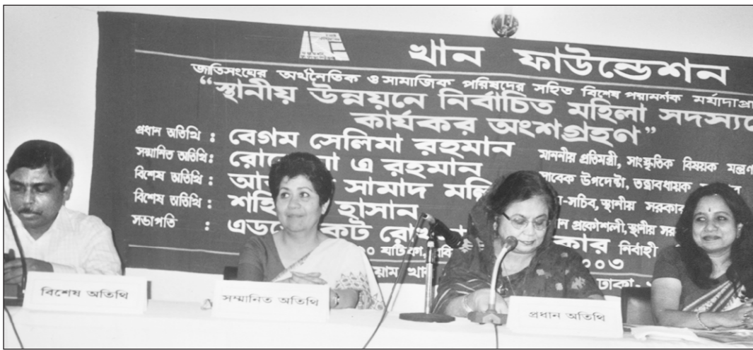
Khan Foundation organised a workshop on 'Active participation of the elected women members in local development' at its auditorium in the city yesterday.