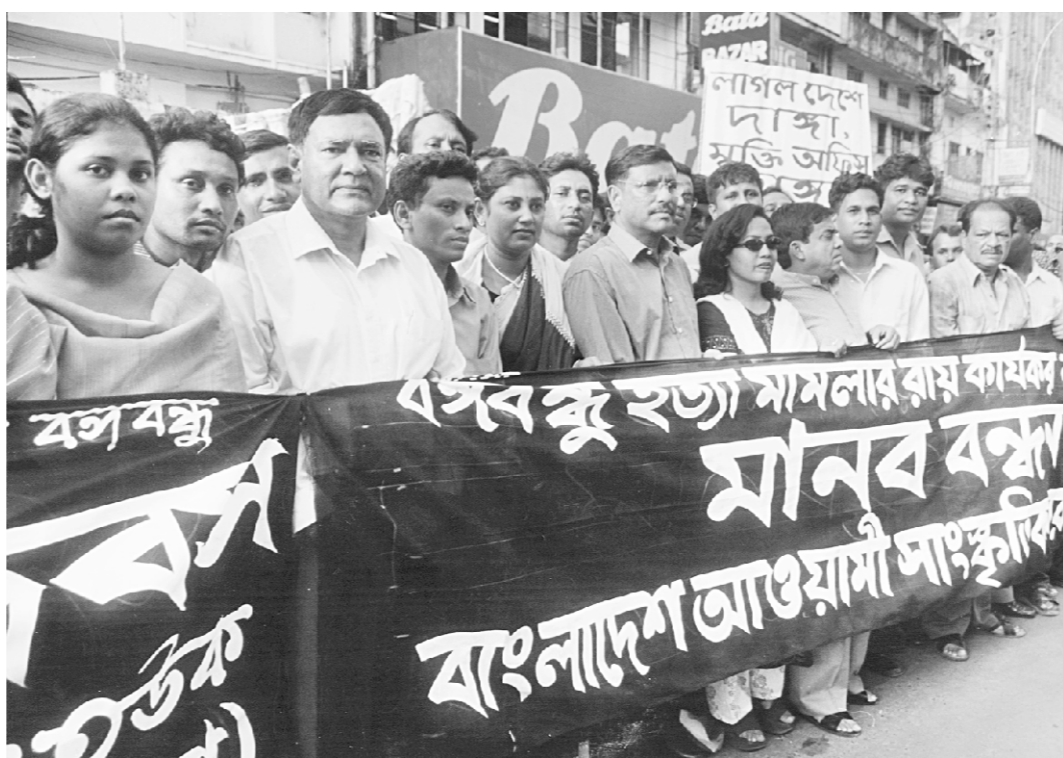
Awami Sangskritik Forum forms human chain at Bangabandhu Avenue yesterday demanding immediate execution of the verdict in Bangabandhu murder case.

They are professional drug peddlers, police said.