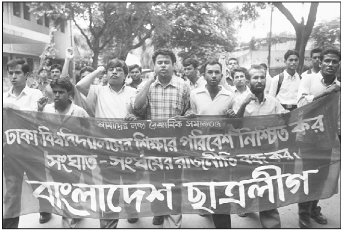
Bangladesh Chhatra League took out a procession on the Dhaka University campus yesterday demanding steps to ensure congenial atmosphere.