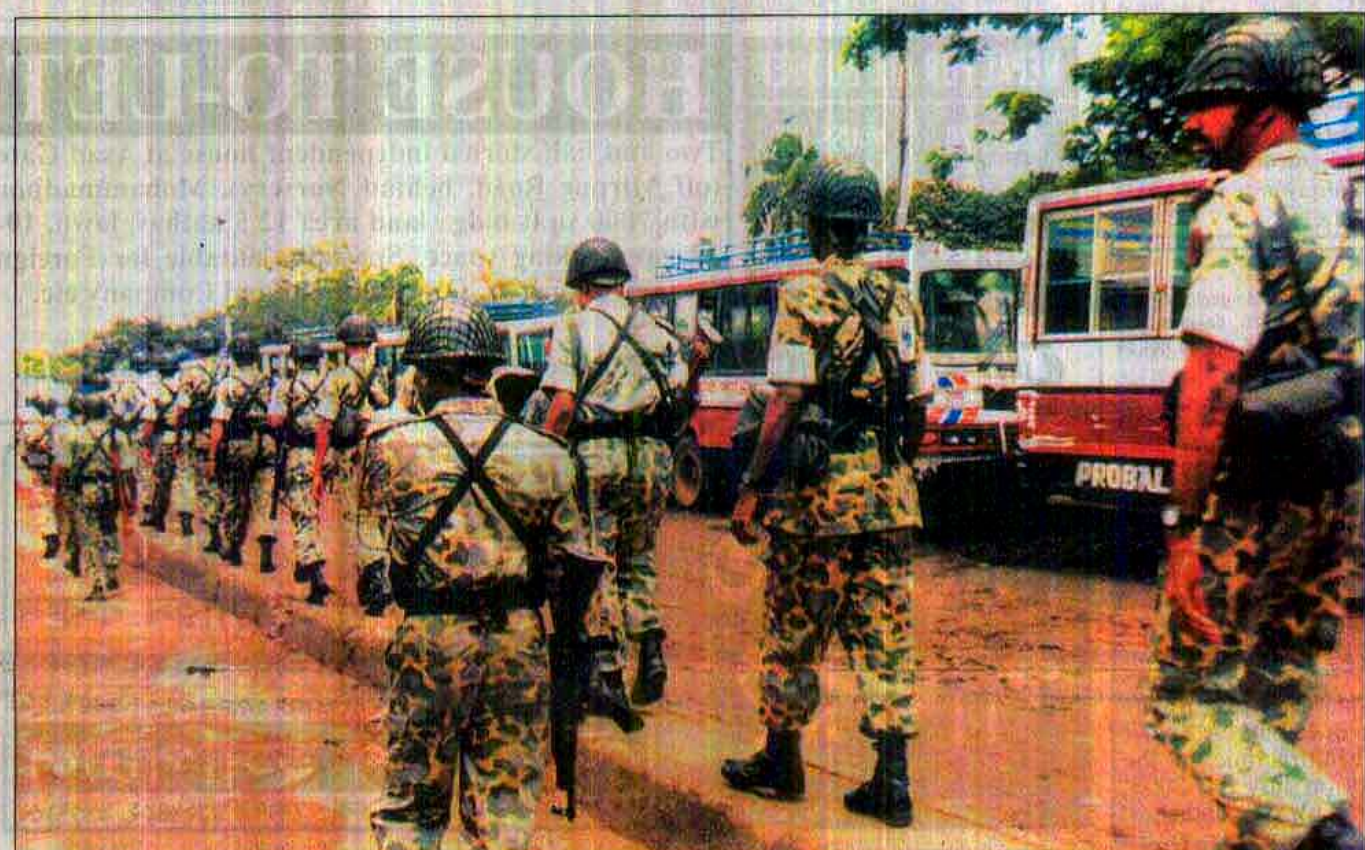
Members of the Bangladesh Rifles walk to Gullistan Bus Station yesterday as part of the joint forces' drive to flush out criminals from the transport sector.