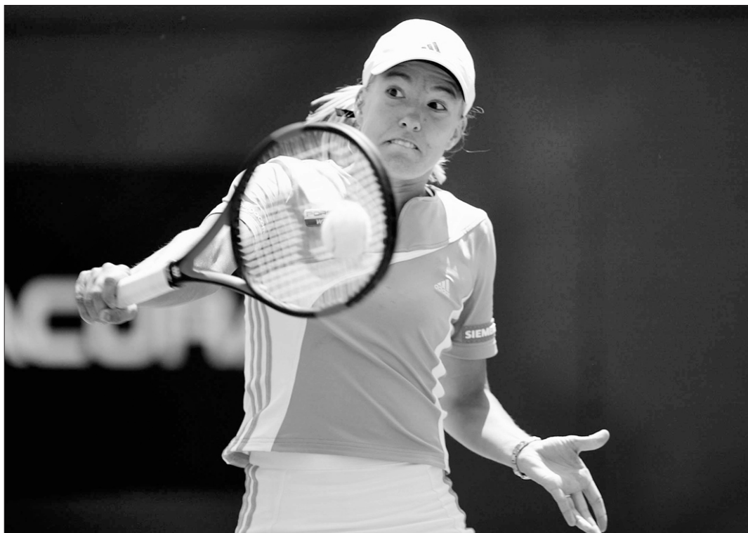
Justine Henin-Hardenne of Belgium plays a backhand against Russian Nadia Petrova at the Acura Classic on Friday.

"But he can learn from this. He realises it's not an easy job."