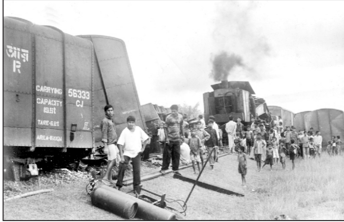
Train accident like this is almost a regular phenomenon on Bangladesh Railway's Lalmonirhat-Burimari route. The photo was taken recently from near Parulia station in Lalmonirhat.