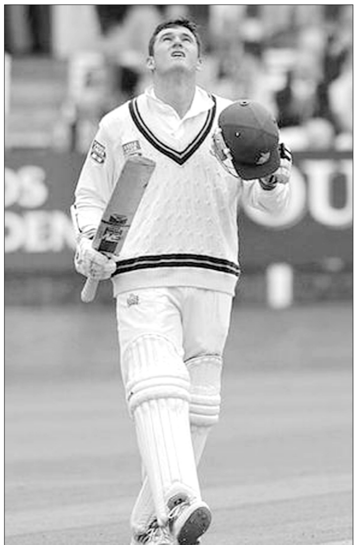
South African captain Graeme Smith is relieved after reaching another 100 against England yesterday.