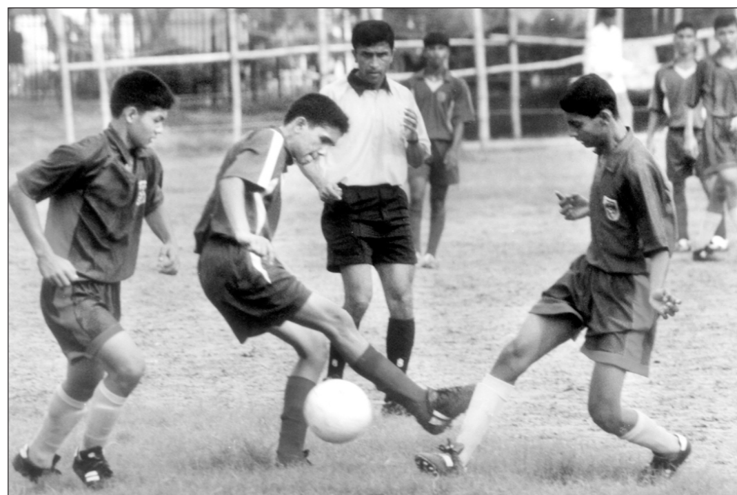
Scene from yesterday's inter-school football match between Nabakumer Institute and Residential Model School at the outer stadium.

Please produce your ID card and an attested passport size photograph while collecting the winner's prize from the Sports Desk of The Daily