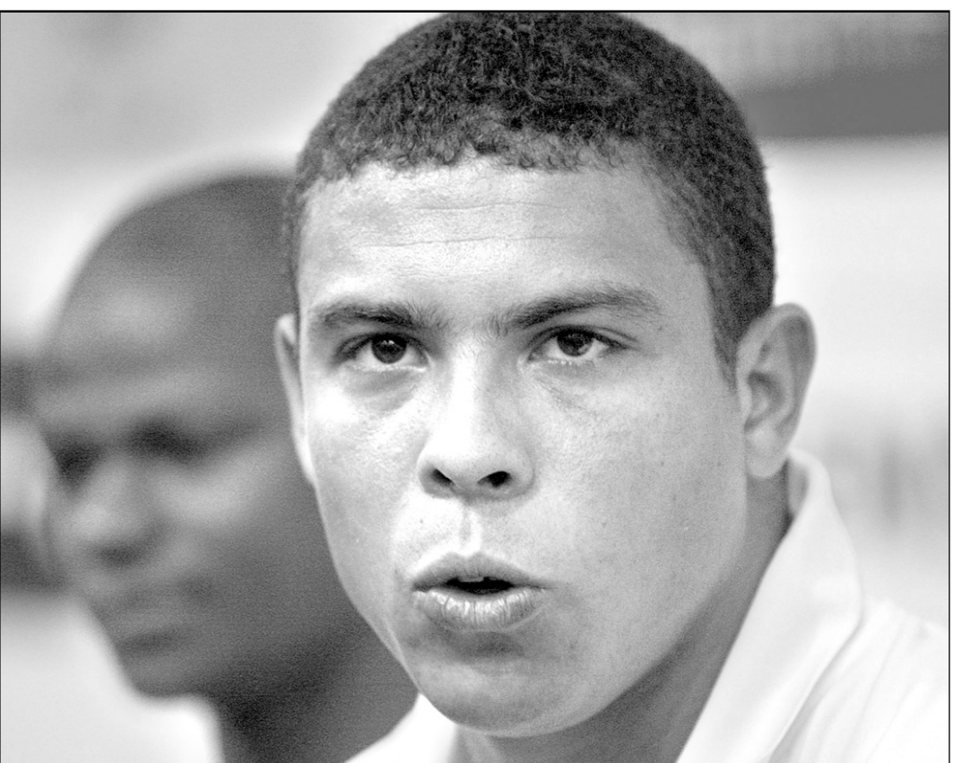
Real Madrid superstar Ronaldo at a media conference at the Hongta sports center in Kunming yesterday.

AFP, Kunming World Footballer of the Year Ronaldo says sex isn't everything and he's got no complaints about abstaining for two weeks while on a tour of Asia. However, the Spanish superstar was clearly flummoxed by the question from a Chinese reporter during a press conference at the Hongta sports centre in Kunming and was heard muttering: "This is tasteless." He recovered his composure to say he would make up for lost time when he got back to Madrid. "well, we're all professionals and we're working and we're only thinking about getting ready and that's it," he said here. "we have plenty of time for sex and we have all our lives for that and two weeks is not going to kill us. And I'm sure we'll make up for lost time." At the World Cup last year, the Real Madrid striker admitted that scoring both goals in the final had been better than sex. "The World Cup is better than sex," he said. "Anyway, the World Cup is only once every four years and sex is not."