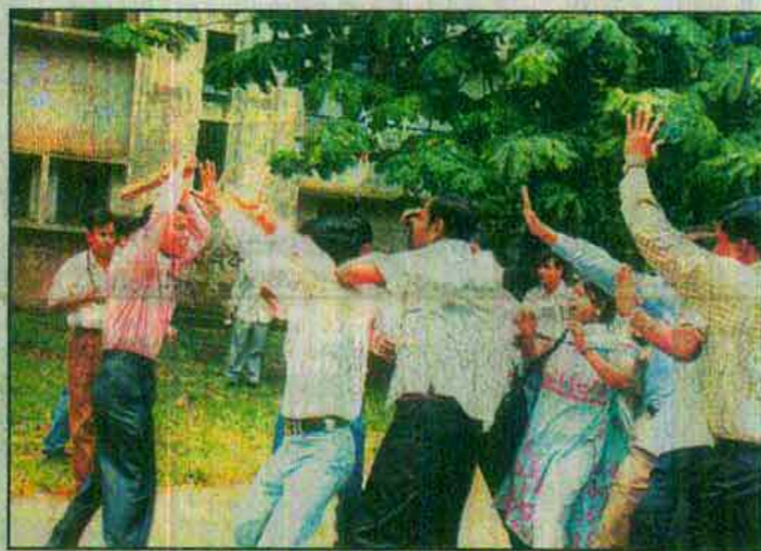
CAMPUS IN RUMPUS: Activists, top, of Jatiyatabadi Chhatra Dal (JCD) prepare on the nose of law-enforcers to attack the activists of Bangladesh Chhatra League on Dhaka University campus yesterday; JCD activists beat up Chhatra League adherents with a wooden block, bottom right, and the JCD activist, bottom left, who attacked a reporter of The Daily Star.