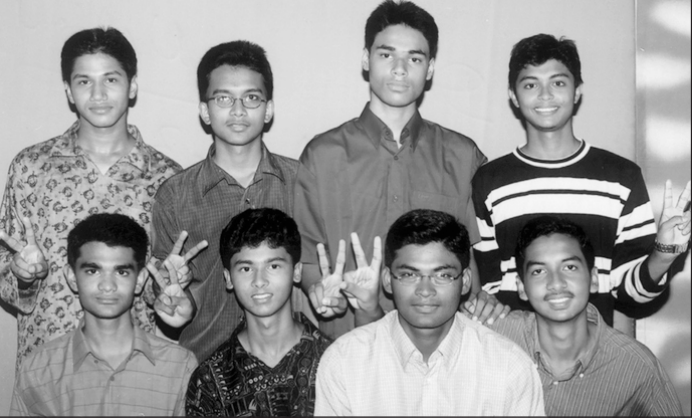
Ten students of Khilgaon Government High School, Dhaka, secured GPA 5 (A+) in the SSC examinations this year. Eight of them pose for photograph yesterday.