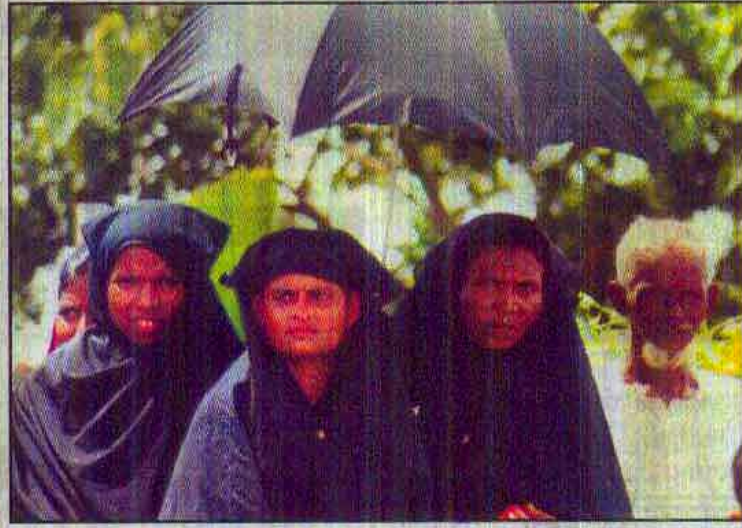
OVER THERE... OH NO... NOWHERE: A villager, left, on the Meghna bank points to the spot midriver where a launch capsized with about 750 passengers Tuesday; men and women, middle, scour the river for their relatives; and people from outlying areas wait for their near and dear ones.