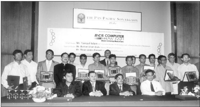
Award winners with the panel of guests at the award ceremony

Dhaka Racing, the first Bangladeshi 3-D game, has been awarded the best product at the show. Texas Group bagged the prize for best stall in the show that carried the slogan 'Where technology meets people'. It was held at the Bangladesh-China Friendship Conference Centre at Sher-e-Bangla Nagar.