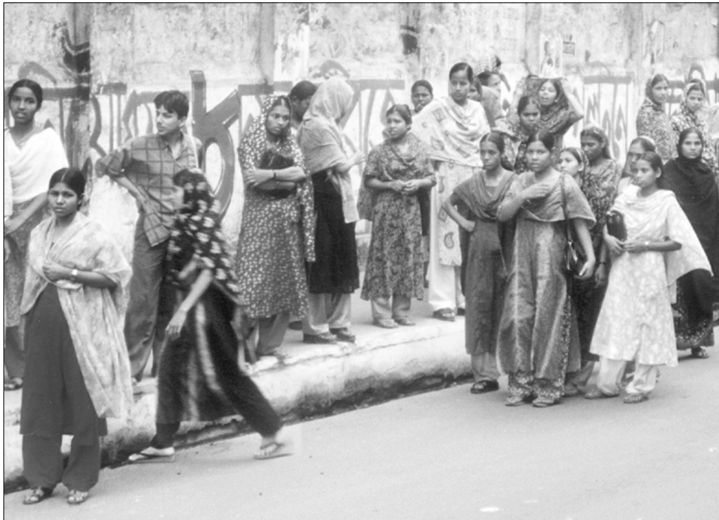
Young women like these, attracted to the city in search of jobs, are targeted by traffickers.