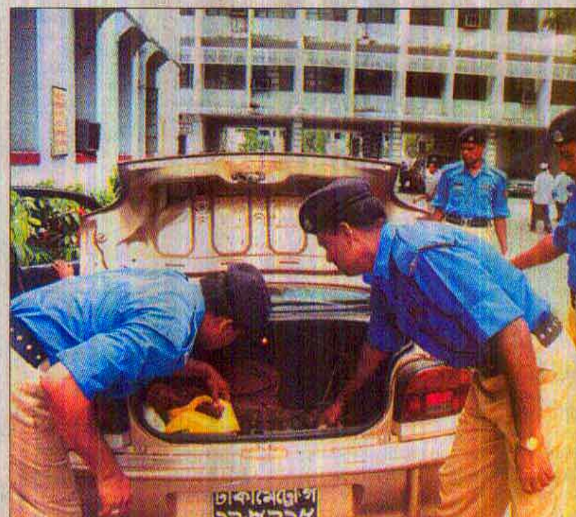
Security measures have been upped in the Secretariat following free fall in law and order. Policemen check a car, left, and a close-circuit camera monitors visitors yesterday.