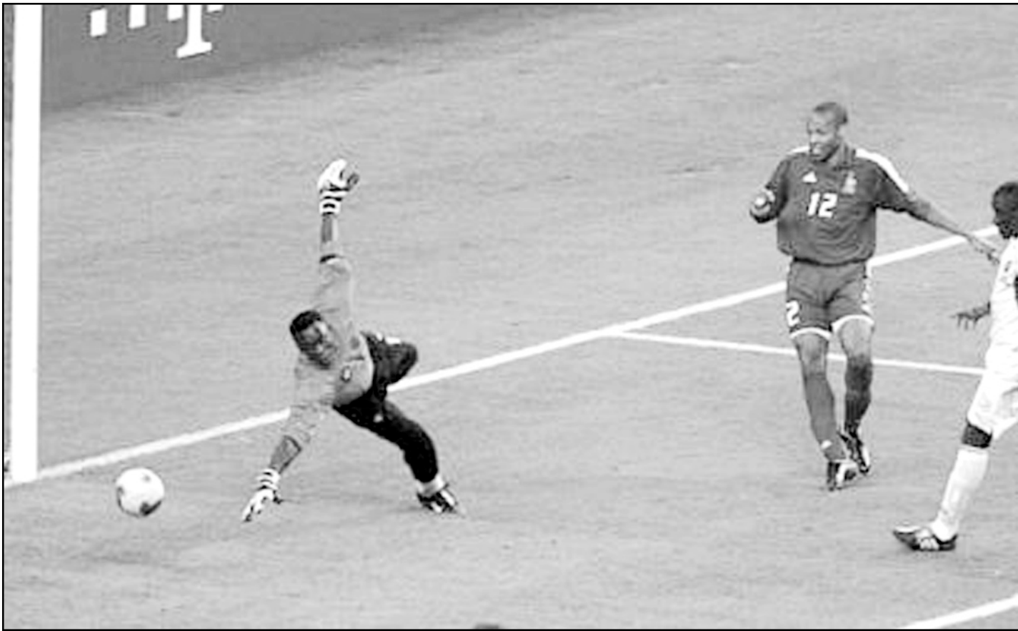
Thierry Henri (R) scoring the golden goal past Cameroon keeper Idris Kameni on June 29.